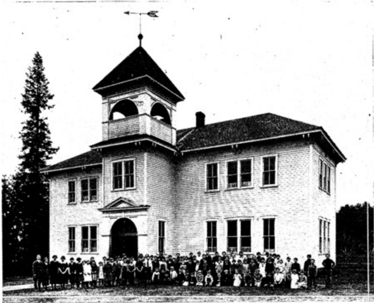
TOLEDO GRADE SCHOOL